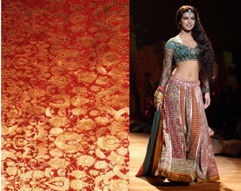
Figure 4. (Right) Bollywood actor Priyanka Chopra wearing a design by Ritu Kumar at India Couture Week, Mumbai, 2008. Retrieved from the Berg Encyclopedia of World Dress and Fashion: South Asia and Southeast Asia .

The men's clothing is very familiar to most Westerners. It is somewhat formal apparel of a neutral color, excluding the golden bowtie. It is reminiscent of something a young man would wear to a high school dance.