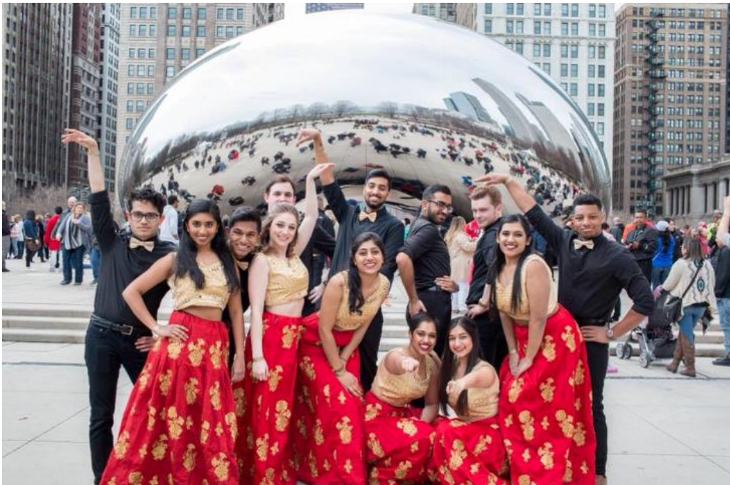
Figure 2. Dhamakapella at their All American Awaaz performance in Chicago, Illinois.

Looking at clothing through the Piercian semiotic triad, I see the following: